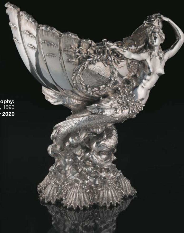
A Tiffany & Co. Silver Yachting Trophy: Goelet Cup , New York, 1893 Acquired by the Yale University Art Gallery | November 2020