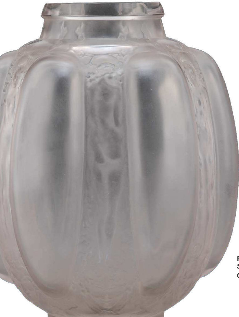
R. Lalique Clear and Frosted Glass Six Figurines Et Masques Vase , circa 1912 Offered by the Dallas Museum of Art | May 2023