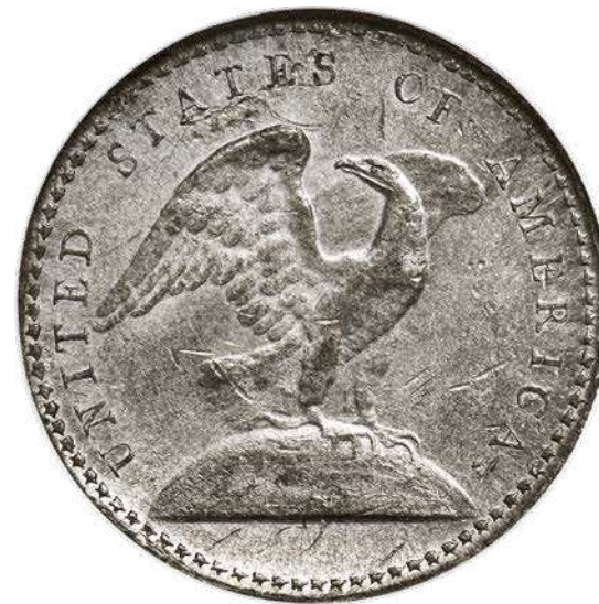
1792 Judd-13 White Metal Quarter, AU58 The Finer of Two Privately Held Only Two Other Museum Specimens Offered by the New-York Historical Society | April 2021