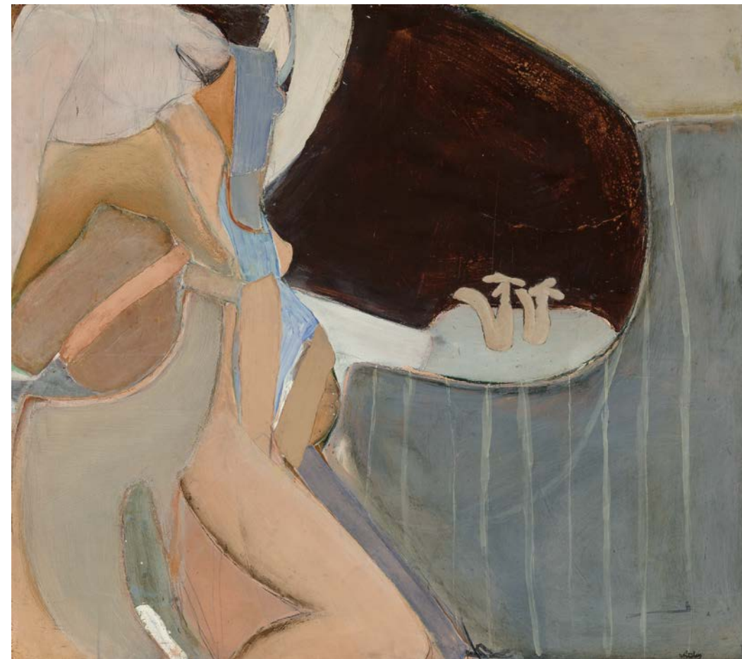
Brett Whiteley (1939-1992) Nude Beside the Basin , 1963 Oil and tempera on panel Offered by the Dallas Museum of Art | May 2023