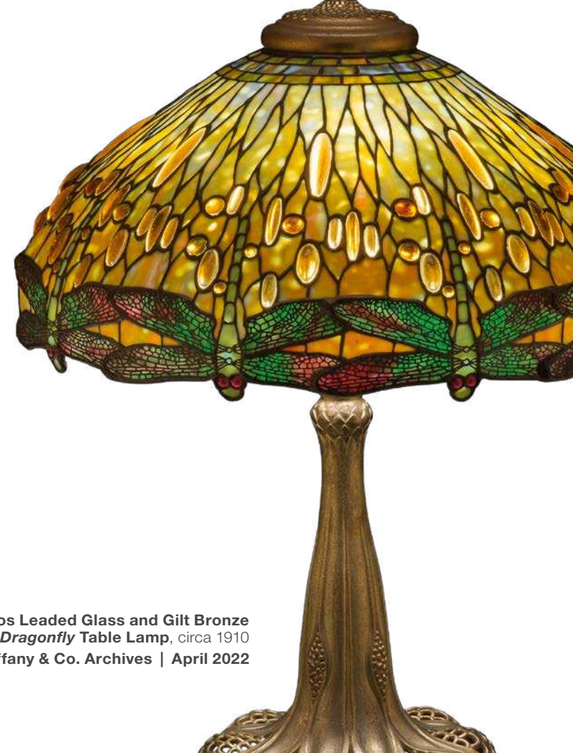
Tiffany Studios Leaded Glass and Gilt Bronze Drophead Dragonfly Table Lamp , circa 1910 Acquired by the Tiffany & Co. Archives | April 2022